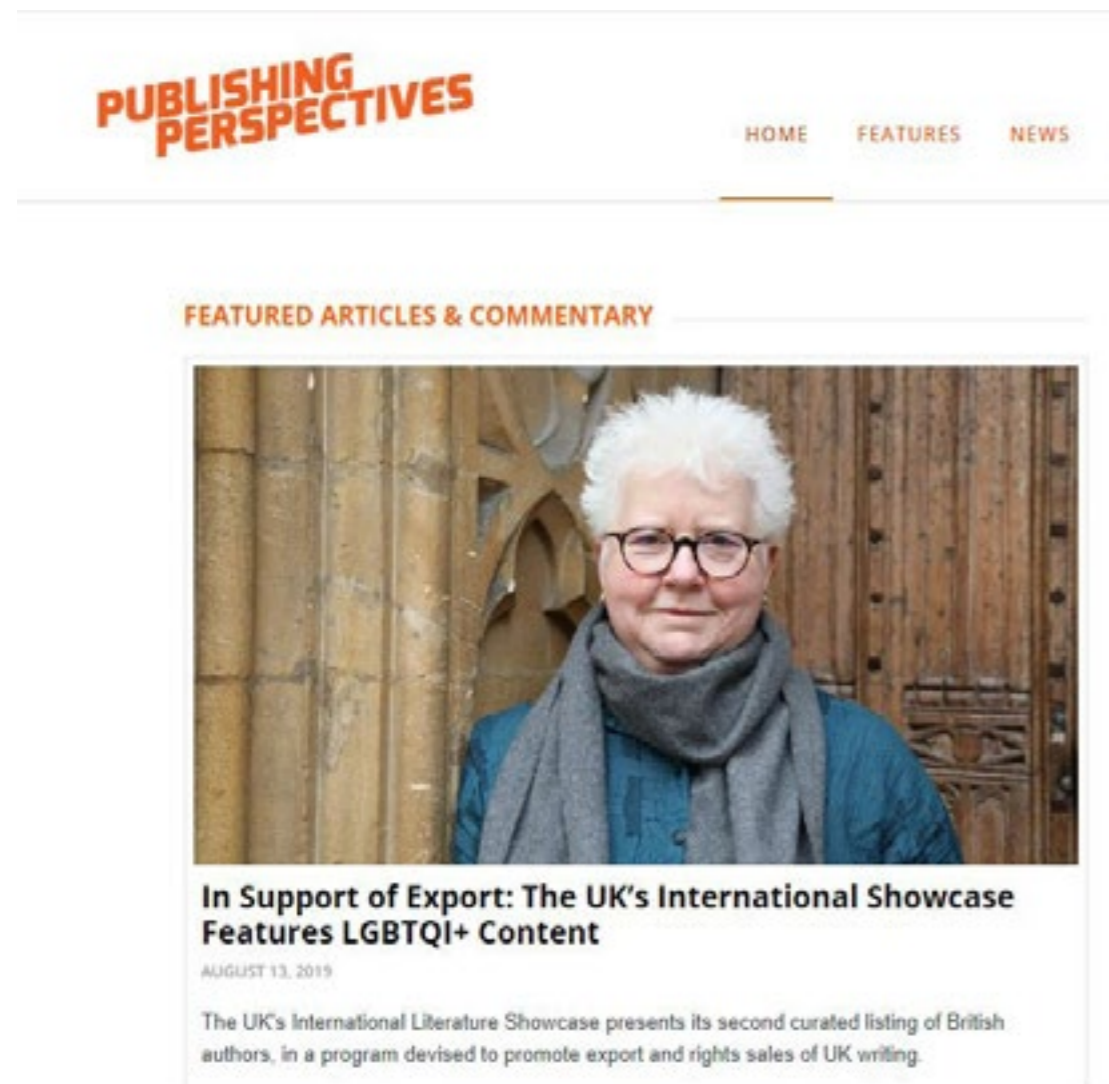
Top left: Publishing Perspectives, 13 August 2019

The launch of Val's selected writers at the National Library of Scotland generated a great deal of discussion online and in the national and international press.