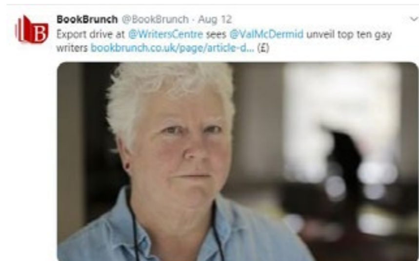
Bottom right: The Bookseller, 10 August 2019